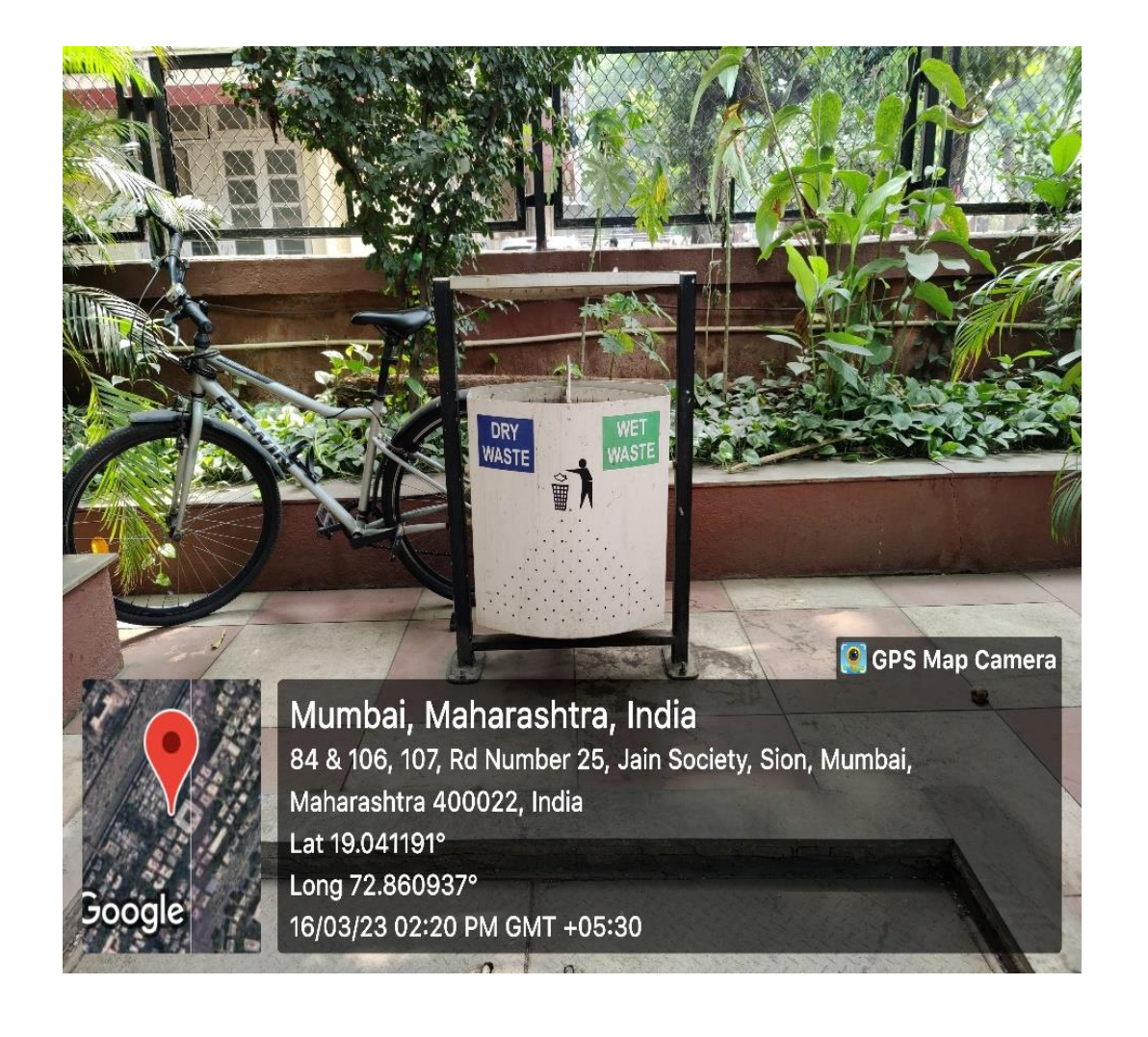
Dry and Wet waste Segregation: